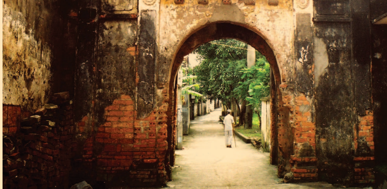
OLD GATE, HANOI